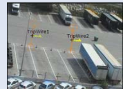
Multi Trip Wire