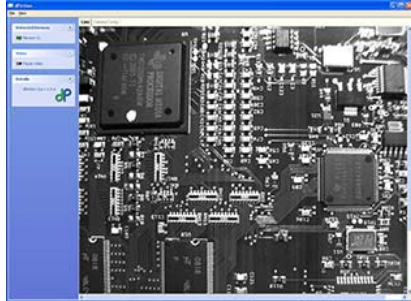
dPiction Main Page