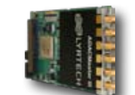
ADACMaster III module