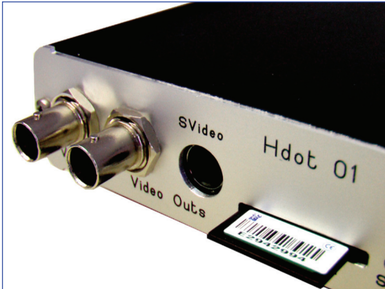
Hdot 01 H.264-MPEG4-H.263 Video Codec

Hdot 01 H.264-MPEG4-H.263 Video Codec Hdot 01 is a video server for the coding of analog video signals with PAL/NTSC standards, for the transmission over LAN with IP protocols and for the decoding of streamed video to analog video.